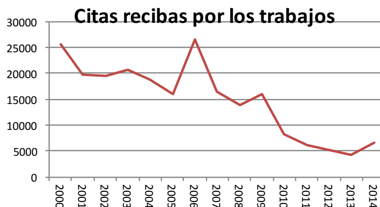
Ilustración 2: Ilustración 2 Citas

Por su parte los autores o grupos de autores más citados se presentan en la tabla 3. En dicha tabla pueden verse 32 autores participando en los 23 trabajos que han recibido más de mil citas. De estos, 15 trabajos (65%) fueron firmados en solitario.